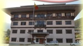
Bhutan Integrity House