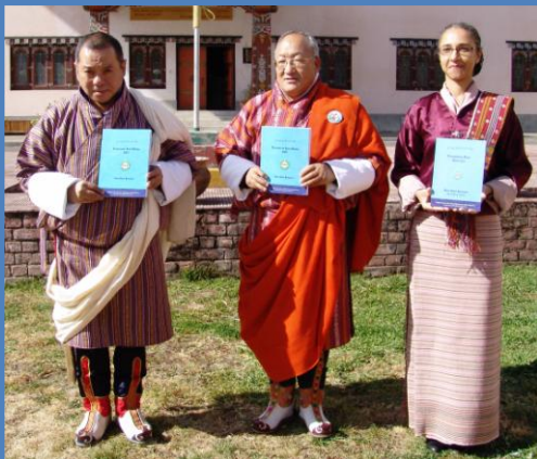
Hon'ble Chief Guest with Auditor General and UN Resident Coordinator during the launch of manuals