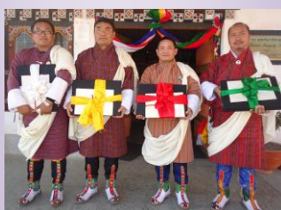
Regional AAGs receive Druk Thuksey Plaque