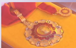
The Druk Thuksey Medal