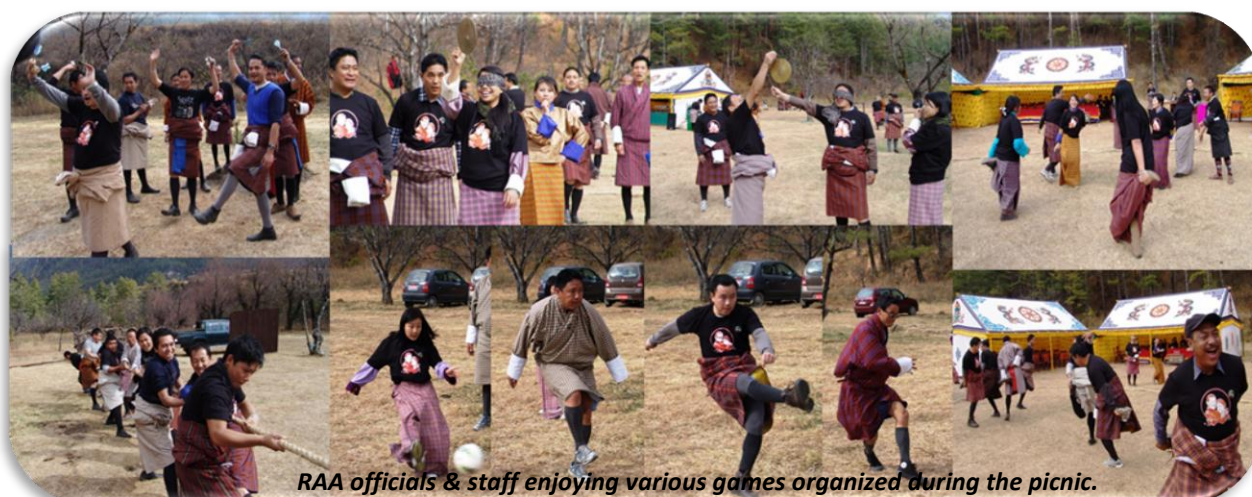
RAA officials & staff enjoying various games organized during the picnic.