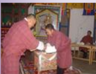
Award for best report & significant observation