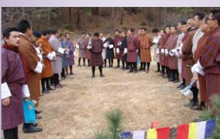
RAA picnic at Pangrizampa